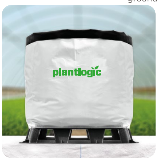
Bag + base pot requires no assembly.