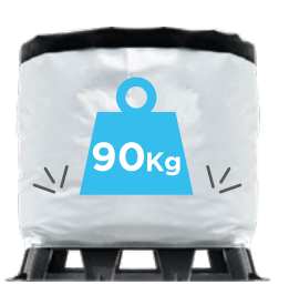
Supports up to 90 kg

Prevent root contact with soil and pathogens for nutrition control and risk management.