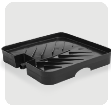
Lysimeter Item # 1301010

Low cost tool for accurate drainage for leachate monitoring.