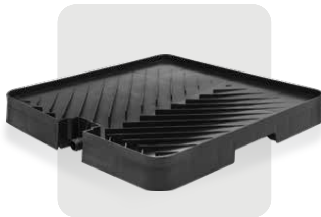
Lysimeter Item # 1301030