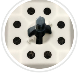
Integrated support to the container

by firmly securing the rigid screw to the middle region of each container stabilizing it.